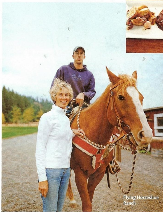
Flying Horseshoe Ranch

>> Roslyn is ideal for walking. Wander past white-steeped churches and by faded pastel