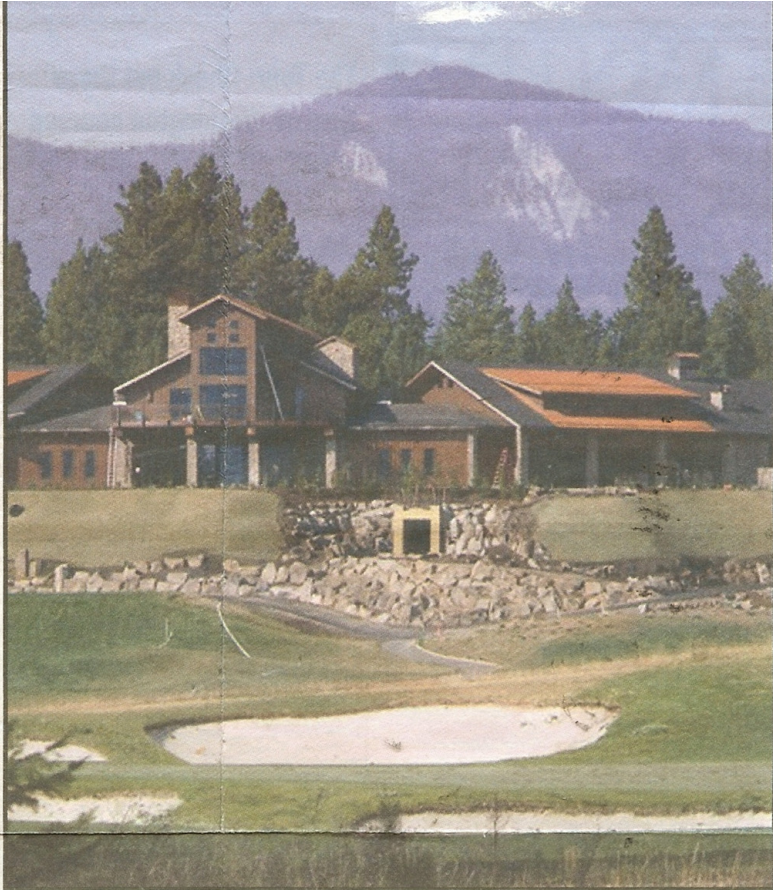
Suncadia Resort is opening its third golf course as Rope Rider opens for public play.

For more information on the resort see www.suncadiaresort.com